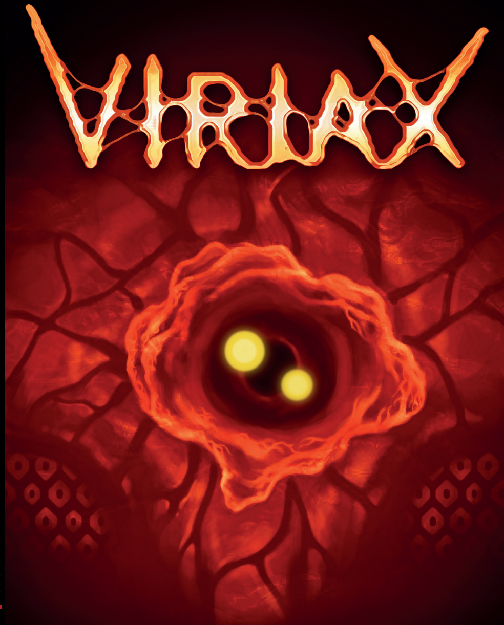
Illustration MAREK BAREJ